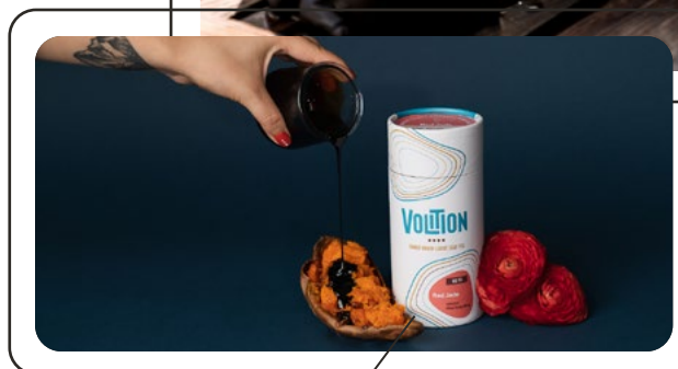
FULL TEA CEREMONY